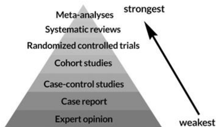
Figure 1: Hierarchy of the strength of scientific evidence of clinical interventions

In the medical and clinical sciences in general, there are several guidelines regarding how to evaluate the strength of scientific evidence of a particular medical and therapeutic intervention which may assist the adoption of evidence-based or empirically supported treatments (Sakaluk et al. 2019; Guyatt, et al. 2008; Balshem et al. 2011). For example, see Figure 1. We note that there are no agreed upon similar guidelines to evaluate the strength of scientific evidence of a specific theory, model or phenomenon.